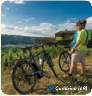
Parc naturel régional Livradois-Forez